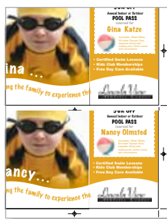
DesignMerge® sequencing allows the creation of multi-up “cut and stack” output.

PPML PRINT DRIVER – reduces the time it takes to print a job, especially those with graphic-intensive layouts. It supports a robust PPML feature set, including the ability to create reusable objects such as background forms and variable images.