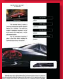
PrintShop Mail lets you print variable images and text based on each individual recipient.