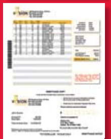
PlanetPress® Suite allows dynamic, variable content printing for transactional documents.