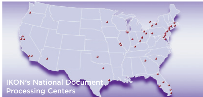
IKON's National Document Processing Centers