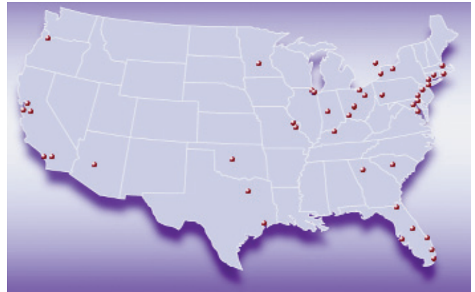
IKON's National Document Processing Centers